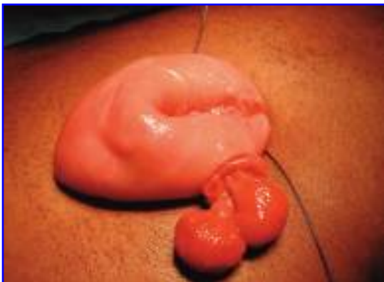
FIG. 2. A single bi-lobed jejunal polyp, which was the lead point for the intussusception.

Gastric heterotopia presenting as a tumorous mass in the jejunum is uncommon. 1 Ectopic gastric mucosa is a well-recognized phenomenon in association with Meckel's diverticulum in the distal small intestine and