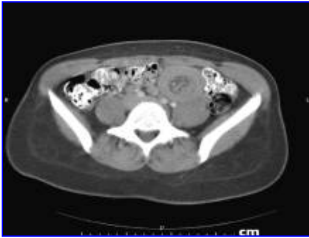
FIG. 1. Computed tomography scan demonstrating intussusception.

bilical incision. Proximal to the transition point there was a palpable intraluminal mass as the lead point (Fig. 2). An enterotomy was made distal to the palpable mass to expose a single bi-lobed polyp on the antimesenteric border. The polyp was resected using an endo-GIA stapler and the enterotomy was closed. The remainder of the small intestine was normal. Histologic examination revealed a giant polypoid gastric heterotopia of the jejunum without atypia (Fig. 3). The patient had an uneventful recovery and remained asymptomatic at 6-month follow-up.