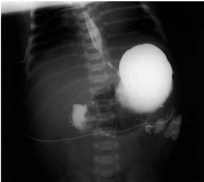
Fig. 2. Upper gastrointestinal series at 1.5 h revealing delayed gastric emptying and minimal filling of jejunum without evidence of anatomic obstruction

duodenal cap, and polyhydramnios can indicate HPS or another proximal GI obstruction. While HPS is traditionally considered an entity seen between 3 and 5