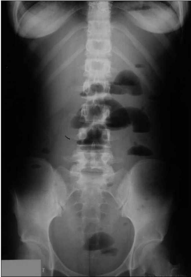
Figure 1. Plain abdominal film revealing multiple air fluid levels.

to identify the cause, relieve the obstruction, and ensure bowel viability. 4 Often, a definitive preoperative cause cannot be determined. In patients whose obstruction is not relieved with nonoperative management, surgery is required to prevent bowel compromise. Laparoscopy provides a tool to diagnose the cause of the obstruction and often to relieve the obstruction without laparotomy. 3,5