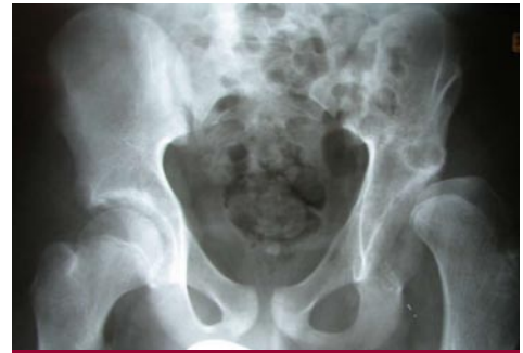
Periacetabular Osteotomy (PAO)