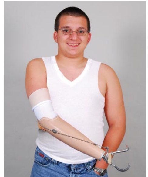
First patient fitted with the "Anchor".

The Anchor is simple in design and the parts are durable, easily available and